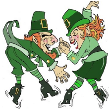
Leprechaun Boogie Down!