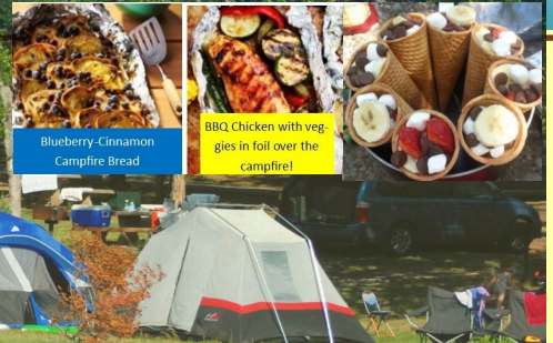
Blueberry-Cinnamon Campfire Bread